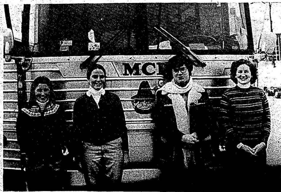
Marist students as they board bus to march in the St. Patrick's day parade in New York City.