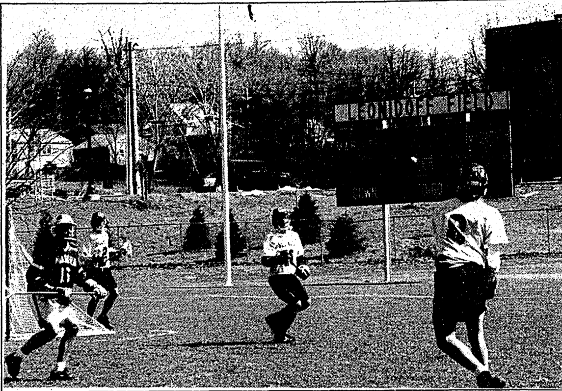
The men's lacrosse team is undefeated in the MAAC with a 2-0 record. They take on Stonybrook on Long Island Saturday.