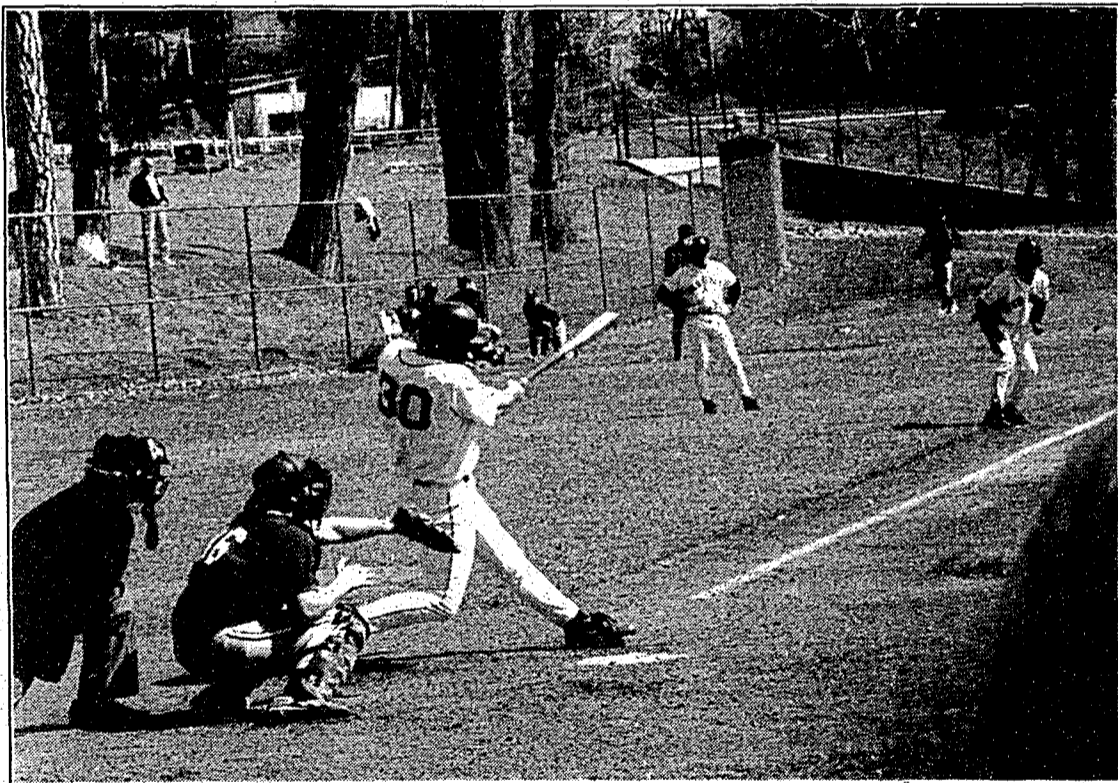
Baseball team is 6-10-1 overall and 1-5 in the NEC. They will play a double-header at Marist against Wagner on Friday.

The team takes on Stonybrook today at 2:30 at Leonidoff field, then travels to Stonybrook on Saturday where they will be looking to continue it's success inside the MAAC.