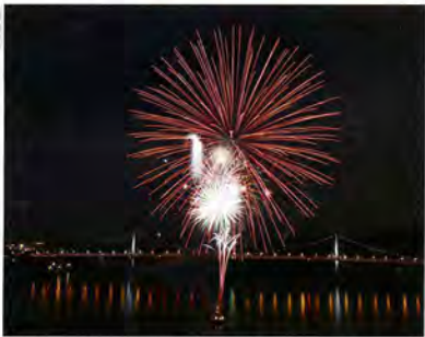
The conference concluded with a reception on the Walkway Over the Hudson and a fireworks display.

To read more guest comments and view photos from the conference, please go to marist.edu/oacac