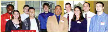
Royal Carting Service Co.

sors a scholarship in the donor company's name. Many companies sponsor more than one; companies making the largest gifts were Royal Carting Service Co. and Sodesho Inc., each sponsoring 10 scholarships.