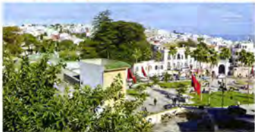
For the first time, Marist fashion students studying in Paris will have a chance to spend three or four days exploring the culture, textiles, and art of Morocco.

T HIS SPRING, Marist students majoring in computer science or Spanish may find themselves building computers for schoolchildren in the Dominican Republic as part of a class. The course is one of several new offerings from Marist International Programs. Also for the first time, fashion students studying in Paris will have a chance to spend three or four days exploring the culture, textiles, and art of Morocco.