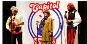
The Capitol Steps performed in the Nelly Goletti Theatre.