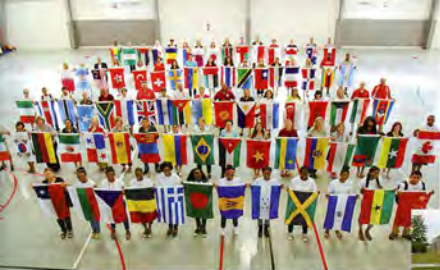
Marist staff and students prepared to guide attendees through the campus by displaying flags from the 85 countries represented at the conference.

Oliver Hazard Payne Mansion, home to the Raymond A. Rich Institute for Leadership Development.