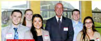
Hickey-Finn & Co., Inc.

During the 2013 campaign, a total of 46 local businesses made contributions of at least $1,000 each to the Hudson Valley Scholars program. Each $1,000 gift spon-