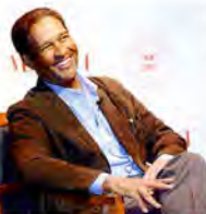
Bryant Gumbel, host of HBO's Real Sports , shared his thoughts on issues in the sports world as part of the Center for Sports Communication Speaker Series in November 2012.