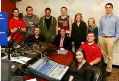
Students serve as assistant producers for The Classroom.

Follow the Center for Sports Communication on Twitter @SportsComMarist