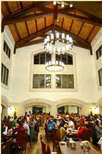
Marist's new dining hall opened in fall 2013. The space was designed by Robert A.M. Stern Architects, whose namesake is dean of the Yale School of Architecture, as part of a project encompassing renovation of the Student Center and construction of an adjacent multipurpose building that houses the Music Department. Watch for more coverage of the new building and renovations in the next issue of Marist magazine.