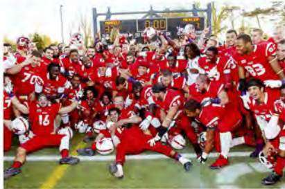
Marist wrapped up a share of its first PFL championship in program history with a 33-7 home victory over Mercer on Nov. 16.