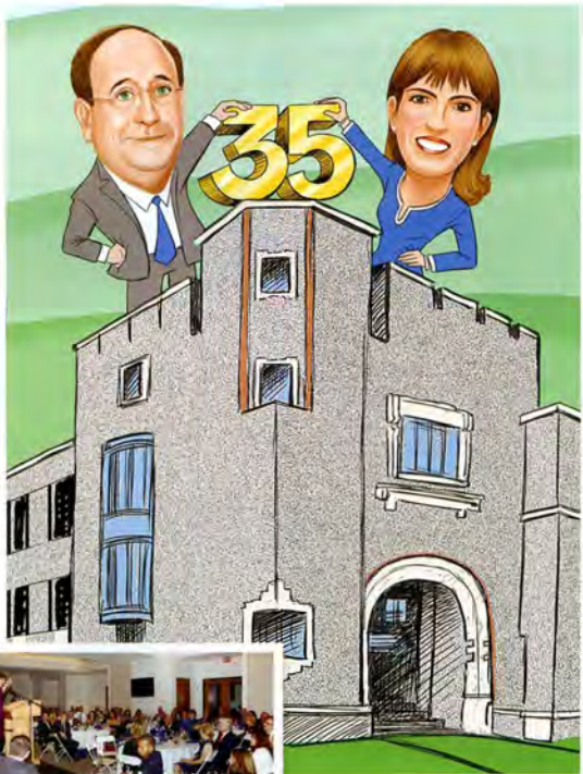
More than 250 guests joined the Marist Poll team for dinner in the newly renovated Student Center.