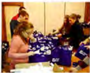
Current Marist pollsters assembled gift bags for guests.