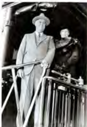
Franklin D. Roosevelt and Eleanor Roosevelt leave the train after returning to Washington, DC, from Hyde Park, NY, in 1935.

FRANKLIN launched with 350,000 pages of archival documents and 2,000 historical photographs, along with many detailed descriptions of archival collections not yet digitized. Users can search the digital collections by keyword or browse lists of digitized archival folders in a virtual research-room environment. Documents include Franklin and Eleanor Roosevelt's New Deal and wartime correspondence with world leaders, government administrators, and everyday Americans. Photographs include public-domain images of the Roosevelts throughout their respective lifetimes, as well as subject areas like the Great Depression, New Deal, and World War II.