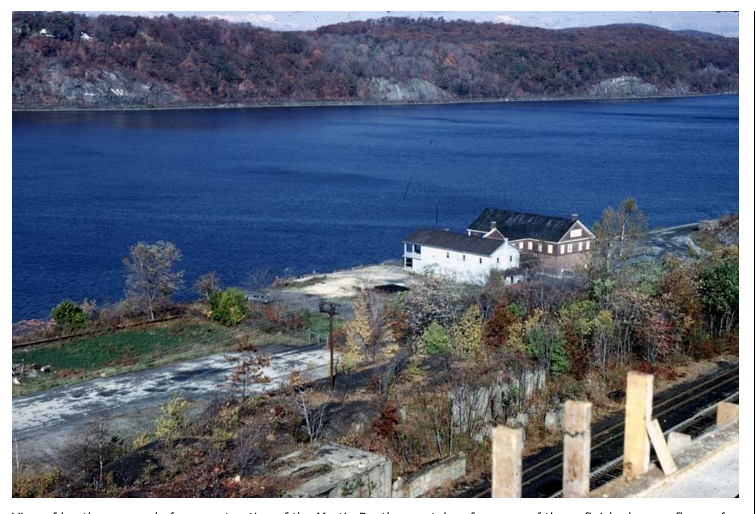
View of boathouse row before construction of the Martin Boathouse, taken from one of the unfinished upper floors of the Leo Dormitory. The California and Cornell boathouses were used by the high schools, and Dutton Lumber began shrinking its supply of aging lumber.