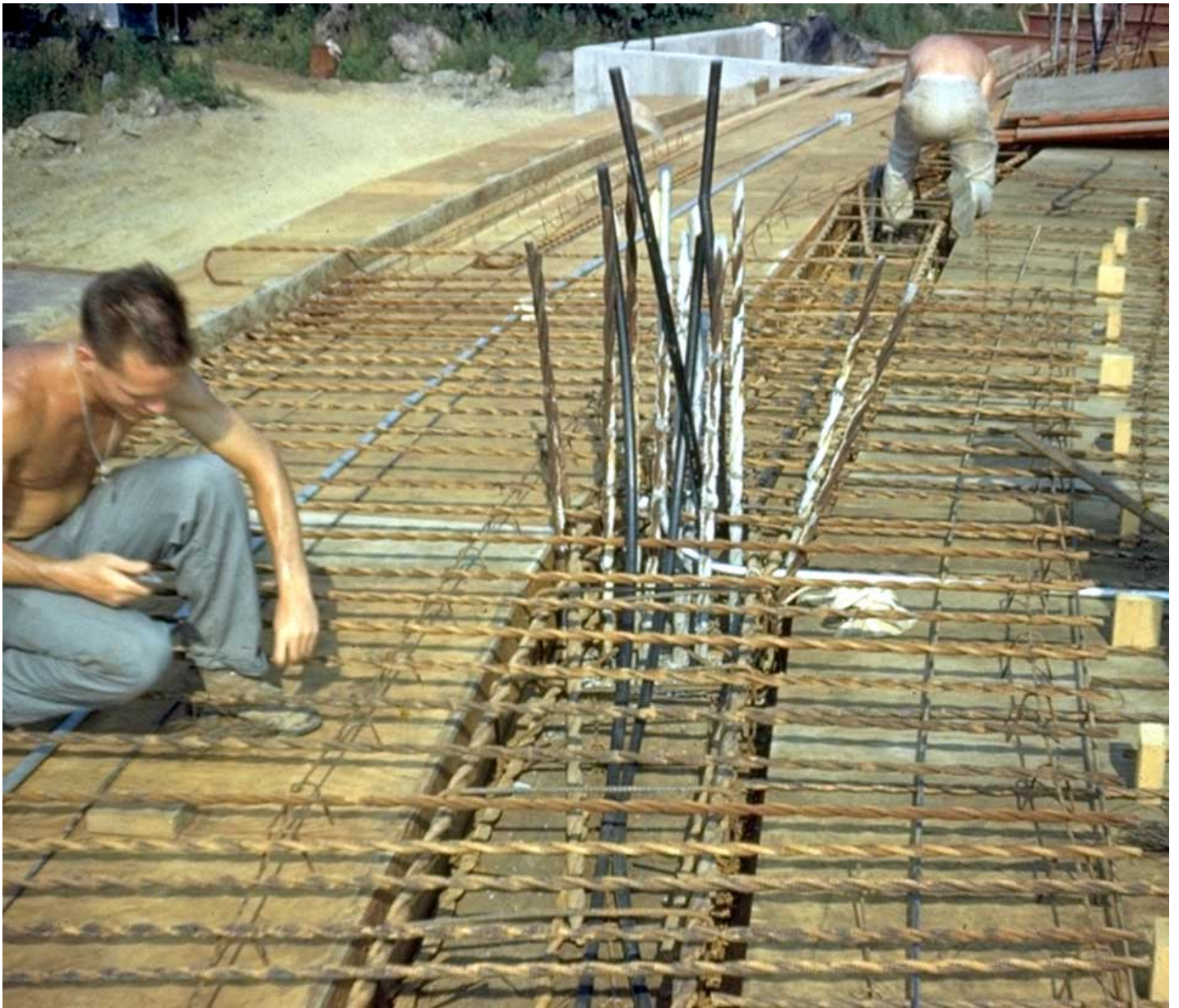
A Brother tying the reinforcing iron before pour of the second floor of Donnelly.