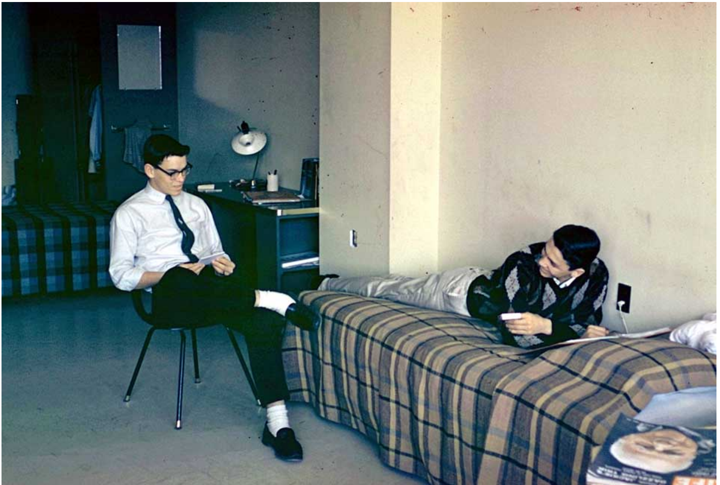
Two floors in the southern section of Donnelly were set up as dormitory rooms, with four students to a room. Note outlet near the bed was finished, but outlet on column between the students were not yet wired.