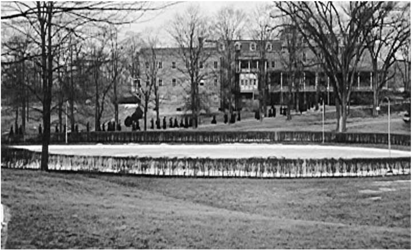
The pool was located near the provincial house. this photo shows student brothers walking to the house for their dinner. The house served as dormitory and dining room and chapel for the student brothers. The hedges in the photo served as a primitive fence.