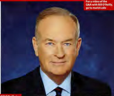
Bill O'Reilly '71

BO'R: Well we had eight. I think, Number One best sellers on contemporary matters, and then I just pretty much had done everything I could think of in that area (laughs). And then I said, "What else am I good at, what else do I like?" You always should do what you like, what your passion is, and that was history. So we decided to write history books that people could have fun reading. And that's the departure. It's not this big, thick "this happened then, this happened then." You can have fun reading Killing