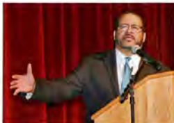
Dr. Michael Eric Dyson, University Professor of Sociology at Georgetown University, spoke on "Race, Racism, and Race Relations in America" in Marist's Nelly Goletti Theatre.

D R. MICHAEL ERIC DYSON, University Professor of Sociology at Georgetown University, presented his perspective on the state of race relations in American society in a lecture in Marist's Nelly Goletti Theatre during the spring 2014 semester.