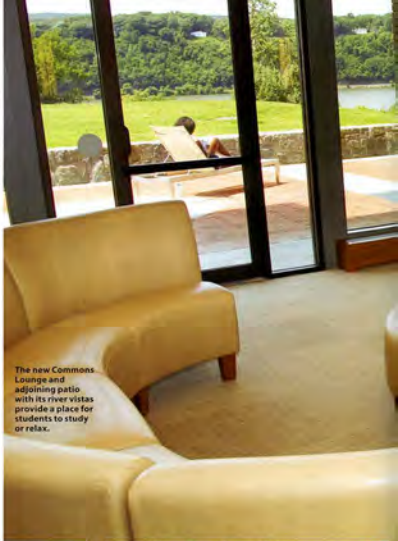
The new Commons Lounge and adjoining patio with its river vistas provide a place for students to study or relax.

The renovation created "pocket" lounges throughout the building for student collaboration, and conference and meeting facilities overlooking the Hudson River.