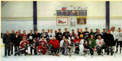
Hockey Alumni Game