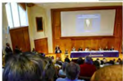
The Fusco Recital Hall provided an ideal venue for a community forum with New York State Attorney General Eric Schneiderman this past summer.