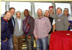
Men's Lacrosse Alumni Day

T HE OFFICE OF ALUMNI RELATIONS welcomes countless alumni to campus throughout the year. This past winter and spring, the Alumni Office hosted Marist Men's Basketball Alumni Weekend in January, the annual Marist Hockey Alumni Game in February, and Marist Men's Lacrosse Alumni Day in March.