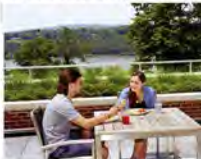
The Dining Terrace offers Hudson River views.