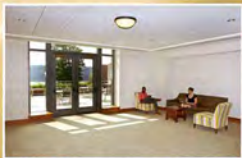
The Dining Hall Lounge overlooks the Dining Terrace and Hudson River.