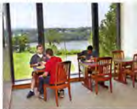
A room in the Dining Hall, overlooking the Hudson River, is designated for quiet dining.

Almost 3,650 meals, on average, are served daily in the new Dining Hall, compared to 3,100 daily prior to the renovation.