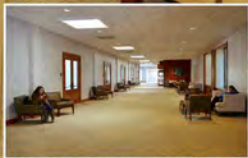
The main hall connecting the Champagnat Breezeway with the rotunda offers seating for reading or socializing.