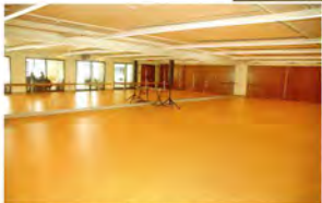
An activity room adjoins the Commons Lounge.