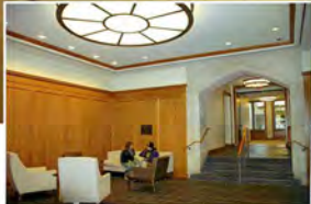
Students meet in the Grand Foyer.