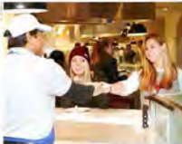
The sushi bar has been a popular addition to Marist dining. Right: Pizza is still a mealtime staple.