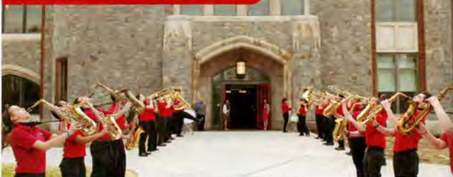
The Marist Band welcomes guests to the dedication of the College's new multipurpose academic building.