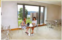
The McCann Lounge provides a convenient spot to meet or study, with Hudson River views.