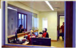
Student workers in the College Activities Office assist a patron.