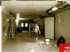
Before-and-after photos show the pop-up art gallery created by Marist art students in downtown Poughkeepsie this past spring.

The art students secured the downtown space for free, got support from the Dutchess County nonprofit Arts Mid-Hudson and they had one month to turn the space into a sleek, welcoming art gallery that created a connection between the students and the local community. Besides renovations, they had to prepare and curate the work and create