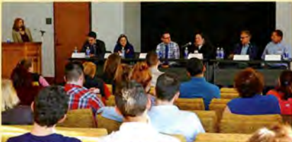
Alumni and friends offered advice to Marist students during a new campus event, "OUT in the Real World."