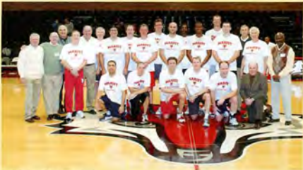
Men's Basketball Alumni Weekend