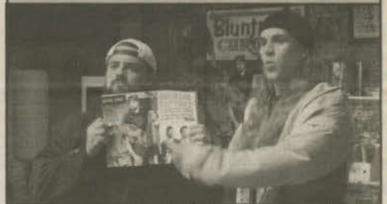
Jay (right) and Silent Bob (left): Legends in their spare time.

I had the privilege of catching Jay and Silent Bob Strike Back during a sneak pre