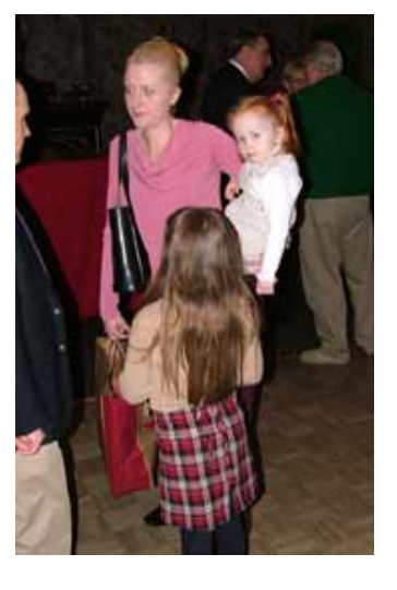
◄ ◄== Two of the younger guests at the party.