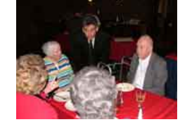
The guest of honor greets visitors from his position at the head table ==►►