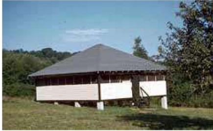
<<=== campers lodgings