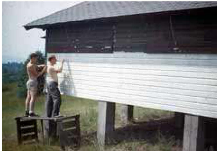
Painters at work